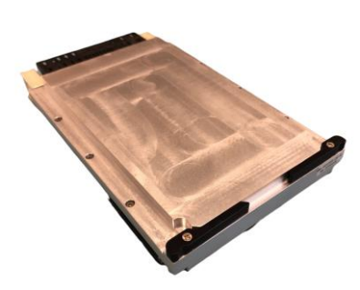
Conduction cooled version

Please note that parallel use of 3 PSU allows 20ms with 750W output power.