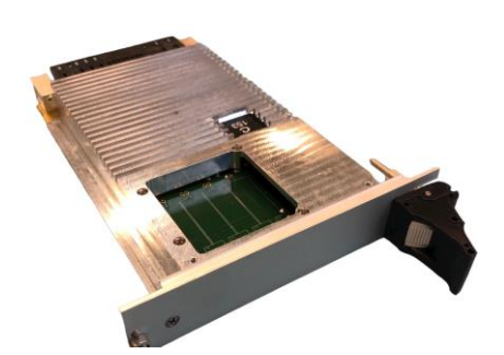
Rugged Air-cooled version

Air cooled PSU module references are: GA-001329-SAx with x= 1; 4 or 8 depending of hold-up tank size.